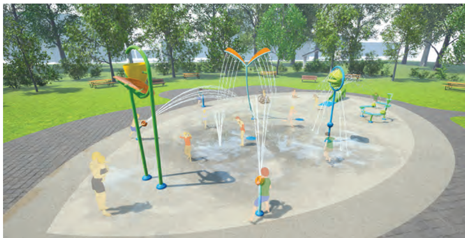
A $600,000 state grant will help transform the site of the 60-year-old Veterans Memorial Pool in Gielt Park into a huge splash pad that will be four to five times larger than that of Southwind or Comer Cox parks.

A new exhibit at Henson Robinson Zoo is getting ready to open in the building where the lemurs and langurs live. Sgro explained