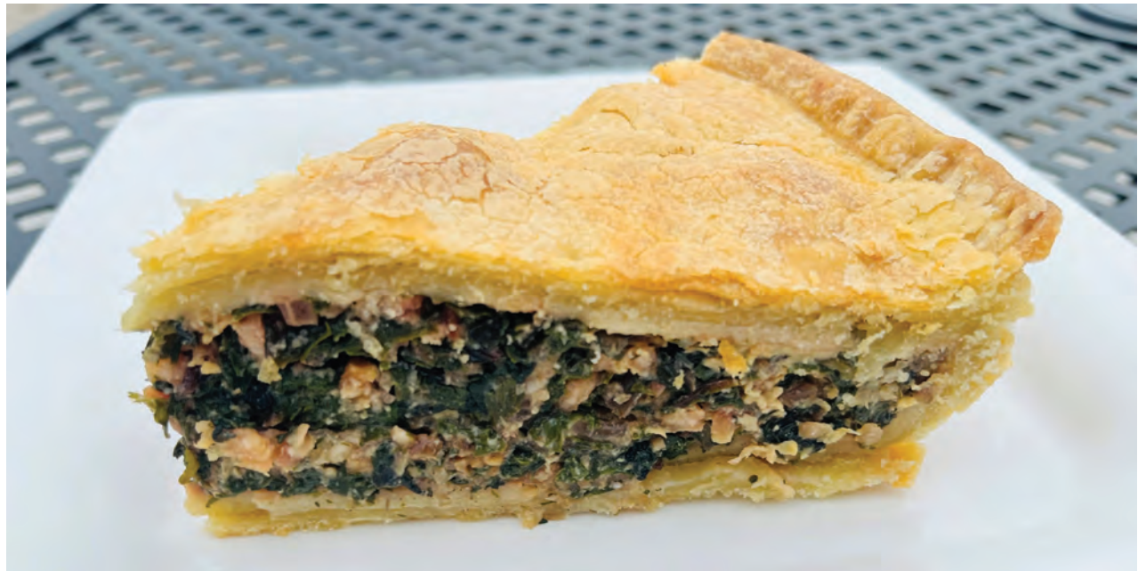
Savory Swiss chard pie.

3 1/3 cups (400 g) all-purpose flour, plus additional for rolling the dough