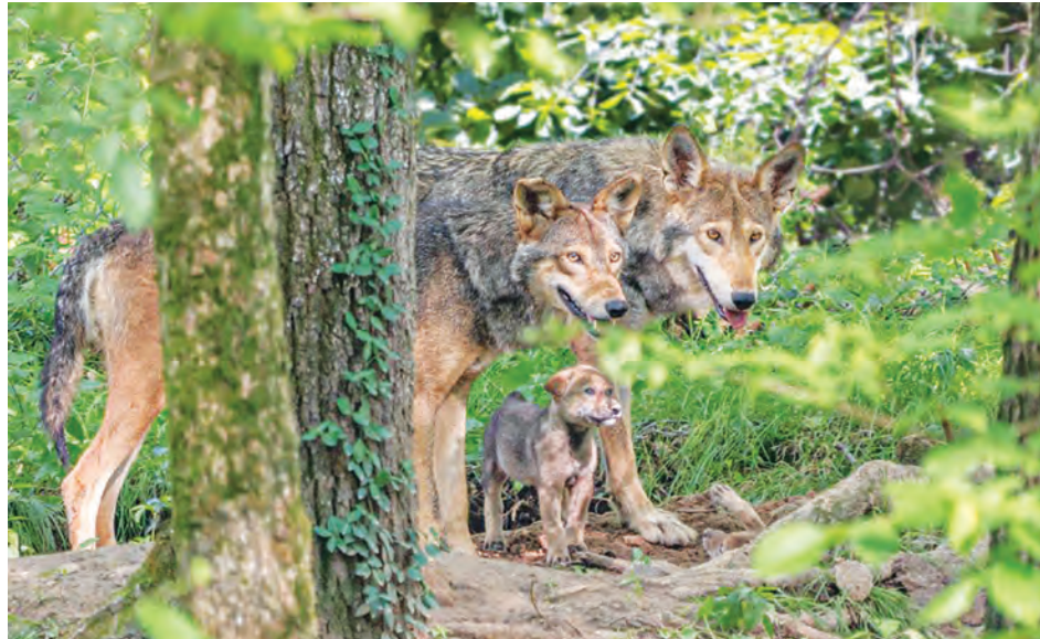
Red wolves find a home at the Endangered Wolf Center in Eureka, Missouri. Other wolf varieties and several kinds of fox also live at the center.

For information and reservations, go to endangeredwolfcenter.org or call 636-938-5900.