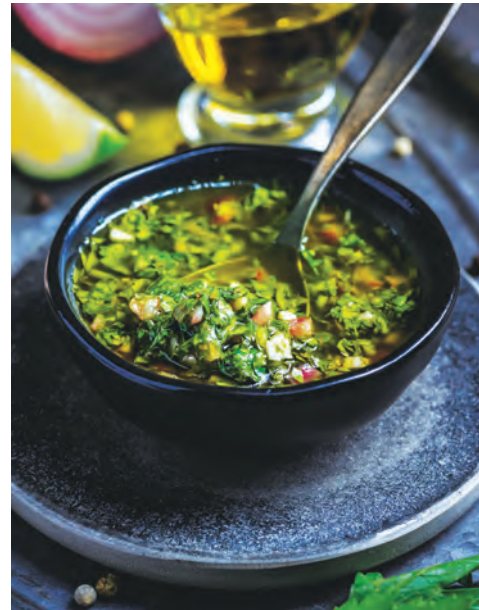
12 FOOD | The sauce is the boss