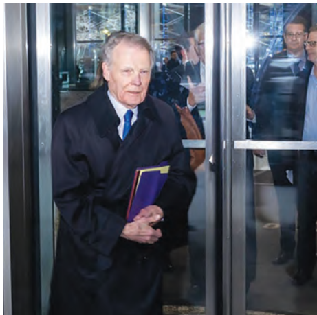
Former House Speaker Michael Madigan exits the Dirksen Federal Courthouse in Chicago on Jan. 3. The U.S. Supreme Court issued a ruling Wednesday that could affect several of the bribery charges he is currently facing.