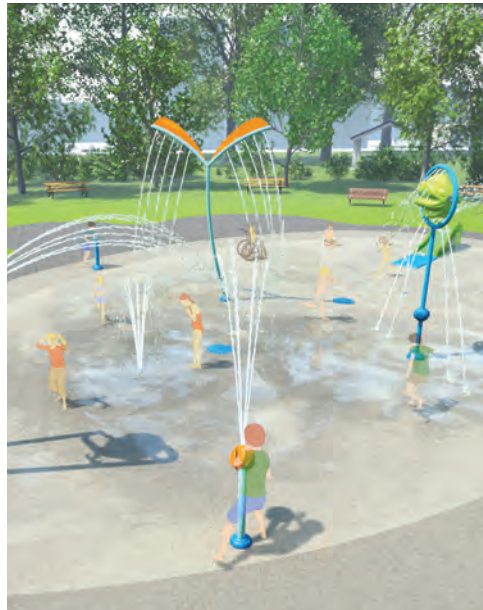
9 PARKS | Making a splash