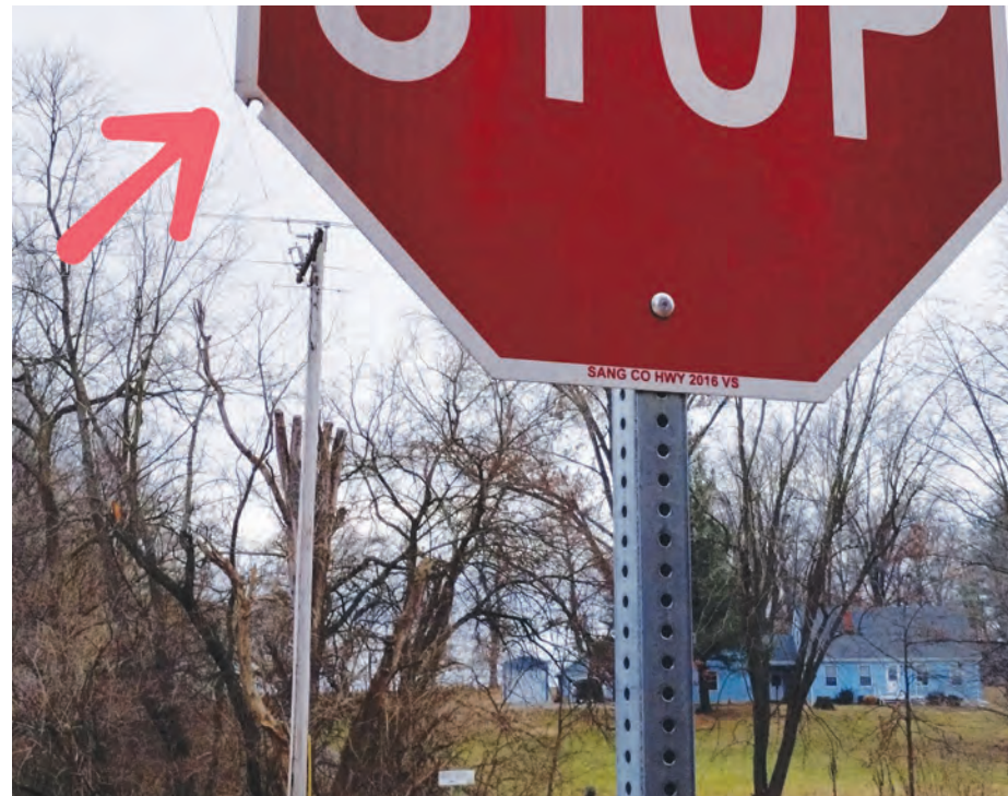
This stop sign in rural Rochester has been used for target practice, a common irresponsible behavior of gun owners.

country road. Across the road, less than a quarter mile away, is a house. There is a bullet hole in the stop sign that was made from a direction that shows that the bullet was fired from a position that put that house in danger. That is an example of irresponsible gun use, and road signs that have been used for target practice are a common sight in rural areas.