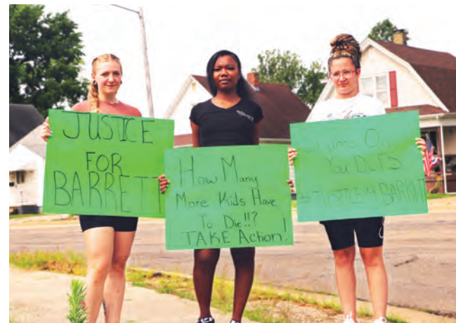
A handful of local residents gathered June 28 outside a DCFS office on North Walnut Street to protest and call for criminal charges to be brought against the foster parents.